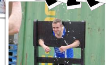
Antrim Rovers charity football match, BBQ and fun night