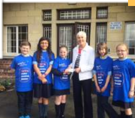
Comber Primary P6 pupils organised a bun sale and also sold loom bands to raise money for MND Research