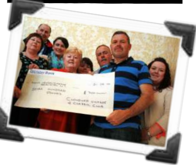
Clonduff Vintage & Classic Club held a tractor run & fun day.