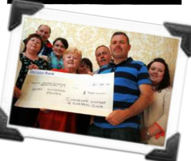
Clonduff Vintage & Classic Club held a tractor run & fun day.