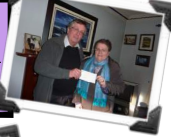
Gelvin Community Group raised funds at Forsythe Bros. Open Day at their new hydroelectric plant