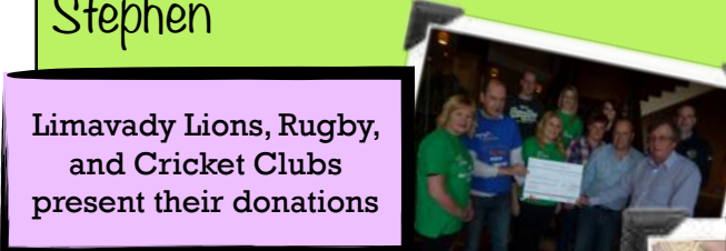
Limavady Lions, Rugby, and Cricket Clubs present their donations