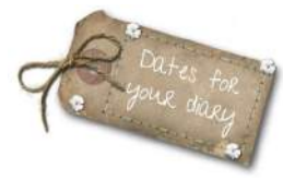
UPCOMING EVENTS PAGE 4