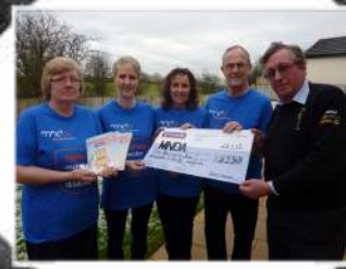
The Chambers Family present funds raised from the sale of 'The Adventures of Henry'