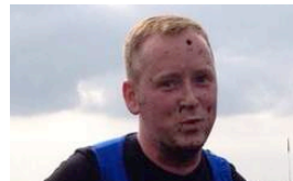
FUN IN THE MUD PAGE 3