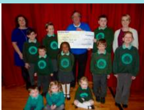
Oakgrove Integrated Primary School held a Christmas Fair.