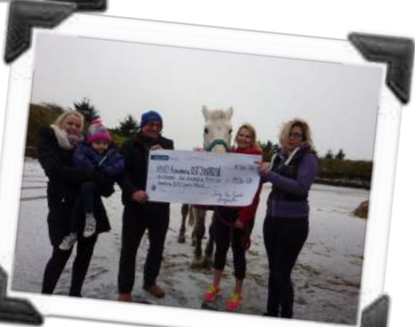
Ballycastle Annual Santa Pony Ride