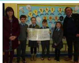
St Anne's Primary School, Derry held a Christmas Fair.

How about keeping SSShhhhh in your school? This year the MND Association is continuing with the Silence Speaks challenge and there will be a schools' pack available though the website www.mndassociation.org