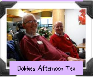
Dobbies Afternoon Tea

GOLFING MATTERS Thank you to various captains in Clondeboy Golf Club (Ladies), Donaghadee Golf Club (Ladies) and Kilkeel Golf Club who have chosen MNDA NI as their charity for the year.