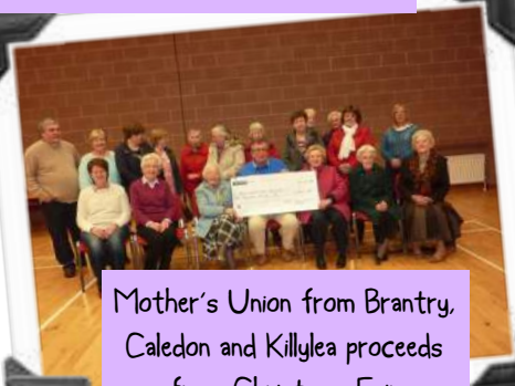
Mother's Union from Branry, Caledon and Killylea proceeds from Christmas Fair