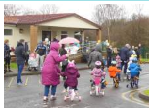
Barbour Nursery School, Lisburn held a sponsored cycle.